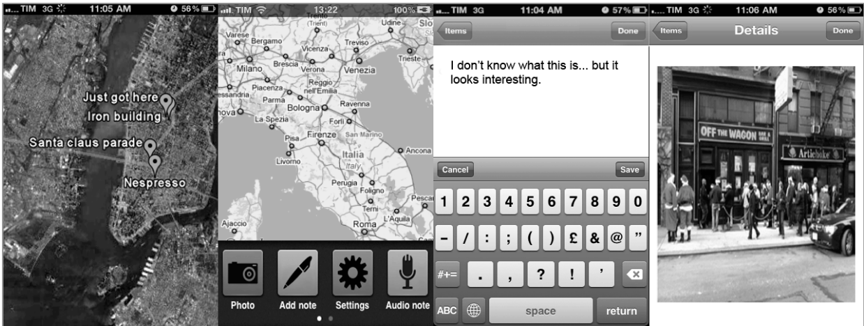
Figure 1: Screenshots of iScout